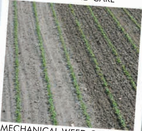
MECHANICAL WEED CONTROL